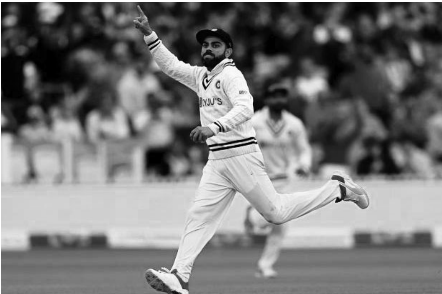
Even the aggression Virat Kohli wears on his sleeve is supposed to emanate from the BCCI’s might

The latest Australia tour cemented BCCI’s place as the most efficient cricket board in the world, to go with its old tag of the richest. India did win the Test series on the previous tour as well, in 2018-19, but